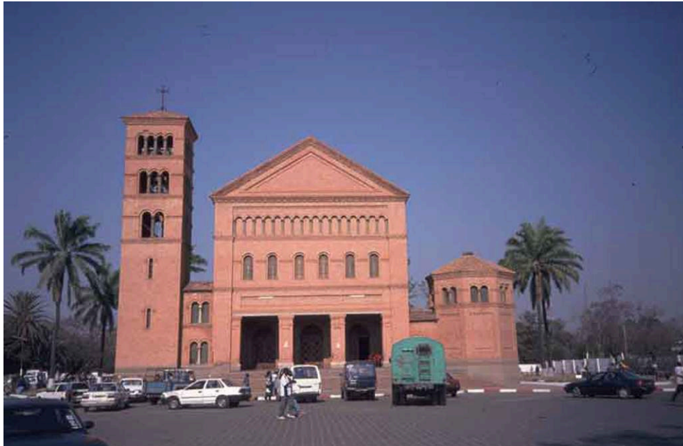
Fig. 4: Cathedral, Lubumbashi, 1921, ©Johan Lagae, 2000.

instance, stands at one of the extremities of the main boulevard, the so-called Avenue de Tabora, 11 along which are situated all public buildings representing Belgian colonial power: on the Place Royale in the middle are located the palace of justice, the commissariat de district and the meeting place of the colonial elite, the Cercle Albert-Elisabeth. Ending the vista of this boulevard on the other side is the cathedral, a building in a Neo-Roman style conceived in 1921 as a monument representing the triumph of Christianity in Katanga. The cathedral blocks the view of the park and the governor's residence from the city center (fig. 4), yet the physical proximity of these two buildings clearly marked a strong symbolic site of Belgian colonial power for the city's inhabitants. 12