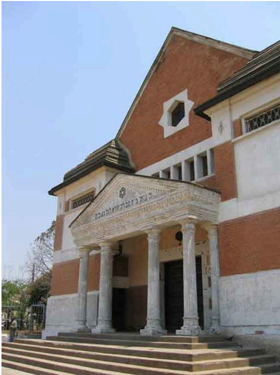
Fig. 3: Synagogue, Lubumbashi, 1929, © Johan Lagae, 2005.