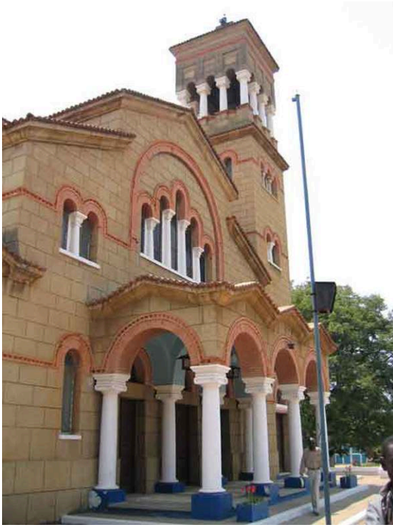
Fig. 2: Greek Orthodox Church, Lubumbashi, 1956, © Johan Lagae, 2005.