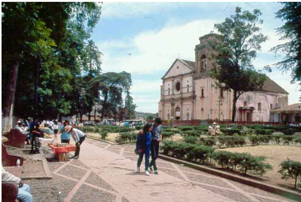
Fig. 1 : Basil Patz, The Basílica of Pátzcuaro sits over the city on a Prehispanic platform a few blocks from the central plaza.

There are outstanding examples of the reuse of whole settlements, foremost the case of Tenochtitlán—Mexico City 3 . Recent research has also unveiled the way in which Mérida, in the Yucatán peninsula, was rebuilt on the site of T'hó, maintaining the scale and basic spatial structure of the Prehispanic city. 4 In the city of Pátzcuaro, seat of the bishopric in the sixteenth century, in the current day state of Michoacán in Western Mexico, the maintenance of the existing urban fabric meant that the church would not face the plaza, but rather was established on a large Prehispanic platform (fig. 1) that overlooks the city. 5